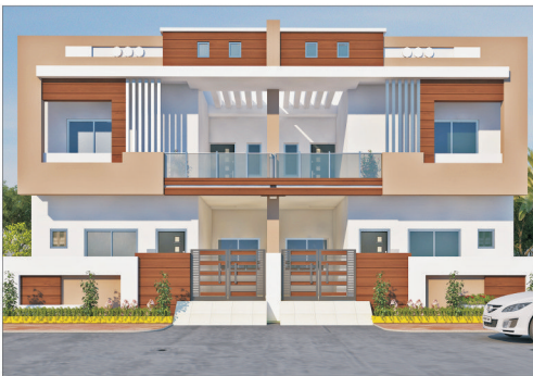
Type - 1