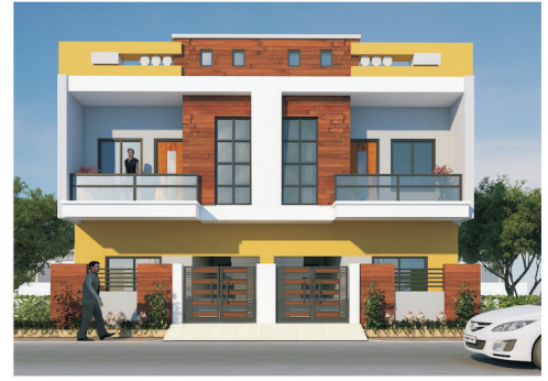
Type - 3