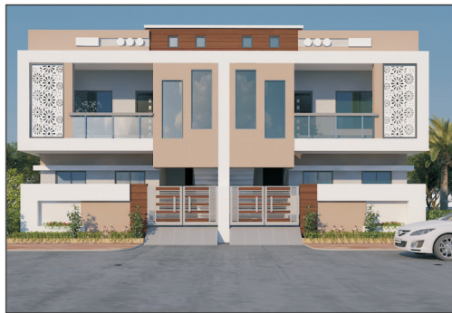
Type - 2